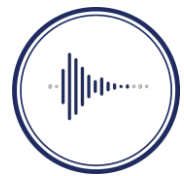
Ambient Noise Monitoring