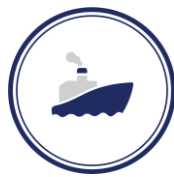
Ship Noise Monitoring