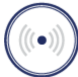
Noise impact studies