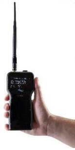
GEOsys recovery system