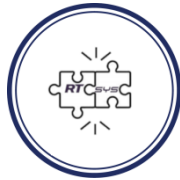
RTSYS Range Inter-compatibility