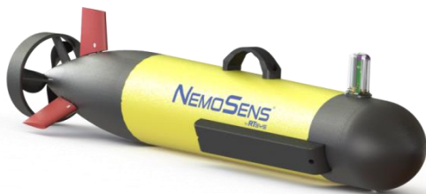
NemoSens geared with RTSYS side-scan sonars